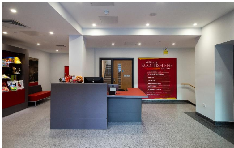
Reception desk with low counter desk area

There is bench seating available in this area. The area is well and evenly lit by ceiling lights.