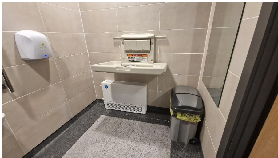
Baby changing facilities within the Accessible Toilet