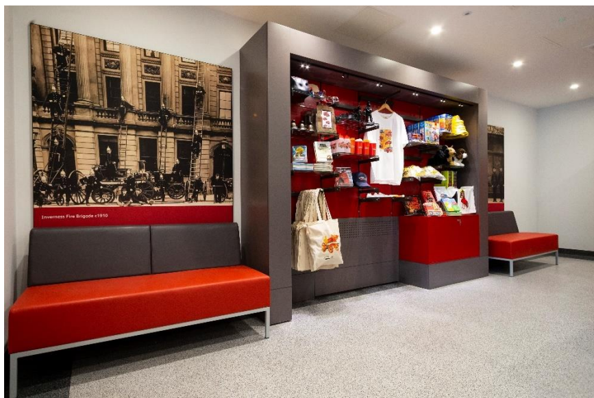
Shop area with bench seating

There is a low counter area and merchandise is displayed on shelves up to a height of 1880mm. Staff are available to help customers who require assistance to navigate between fixtures throughout the shop.