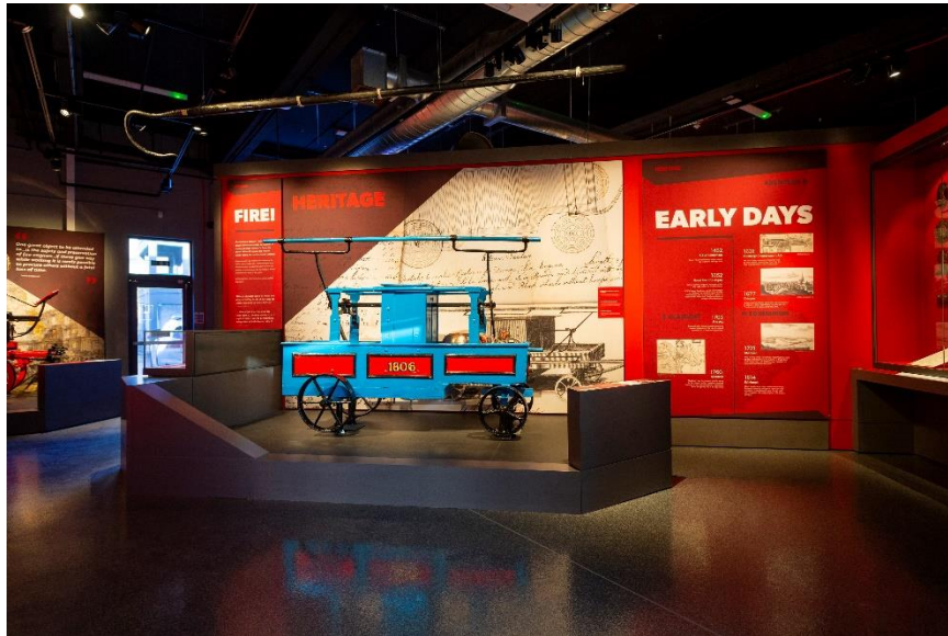
Early Days exhibition with low lighting

Many parts of the museum gallery have low lighting.