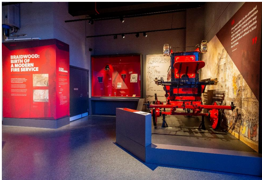
Braidwood: birth of a modern fire service