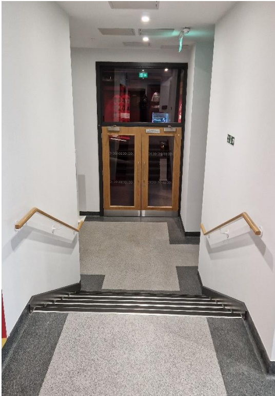
Staircase from reception to museum gallery entrance