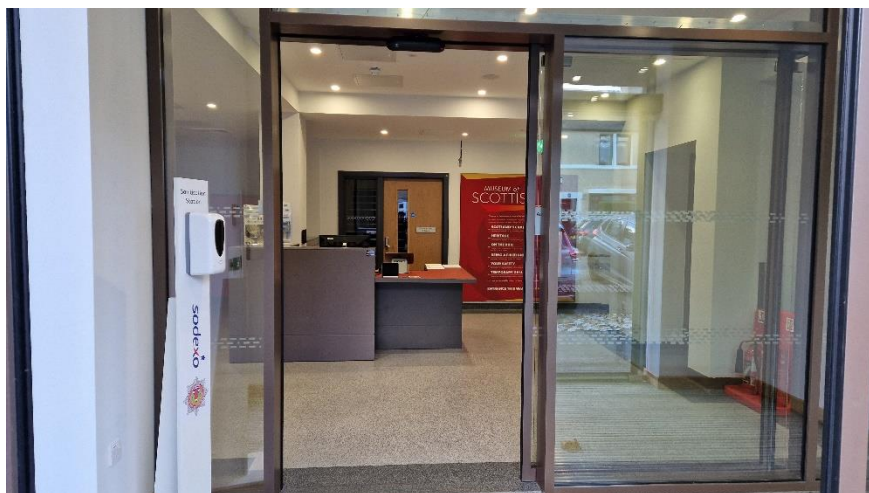
Our main entrance