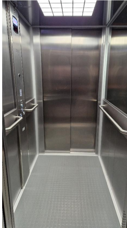
Interior of lift