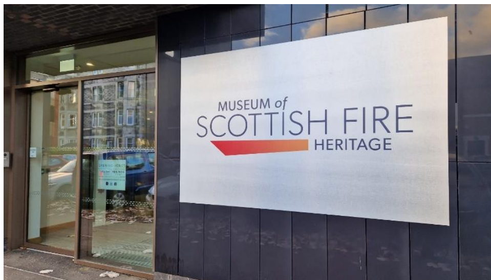
View of our main entrance from the pavement

The main entrance has level access. The doors are 1280mm wide. The main doors are sliding and automatic.