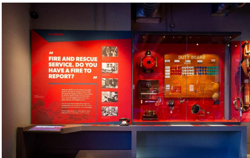
Control and Communications display