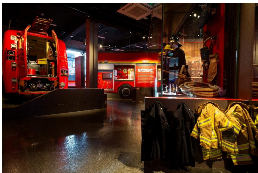
Gallery display of uniforms