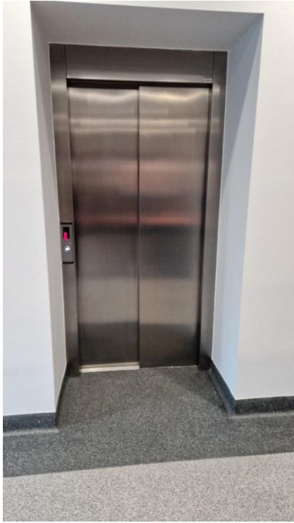
Exterior of lift