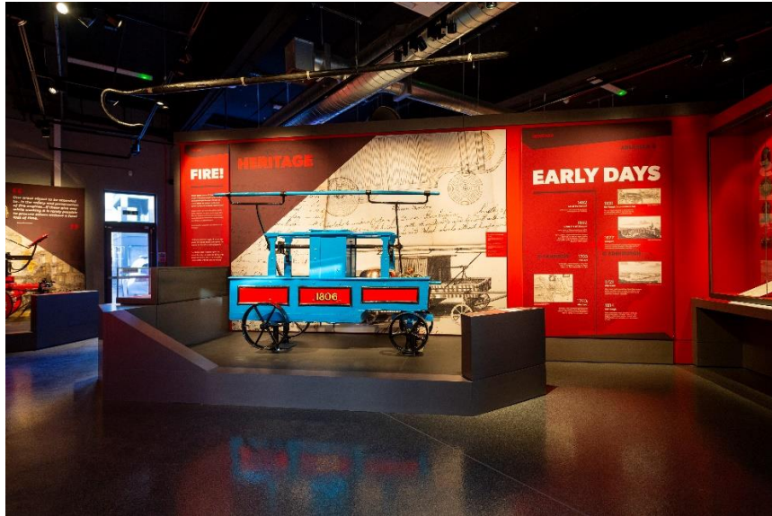
Early Days exhibition