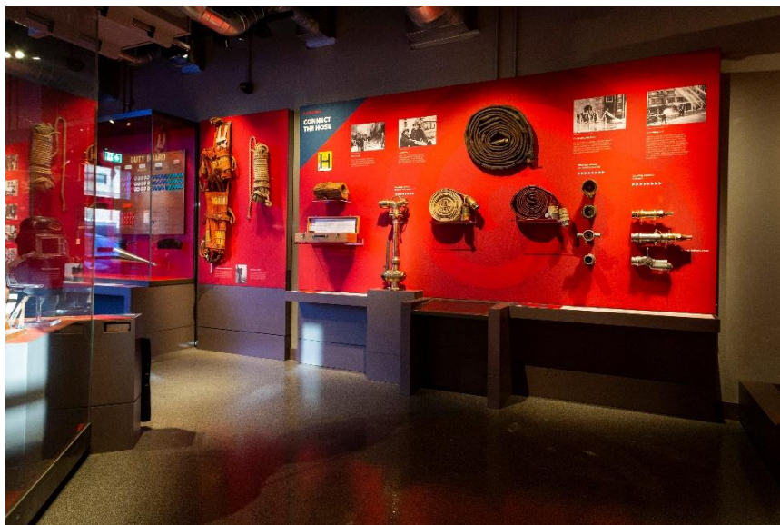
Connect the Hose display