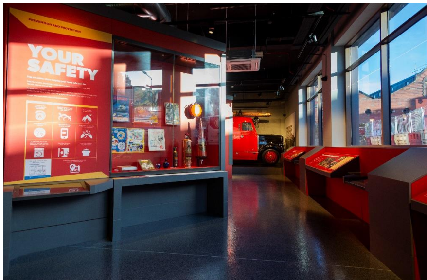
Your Safety exhibition