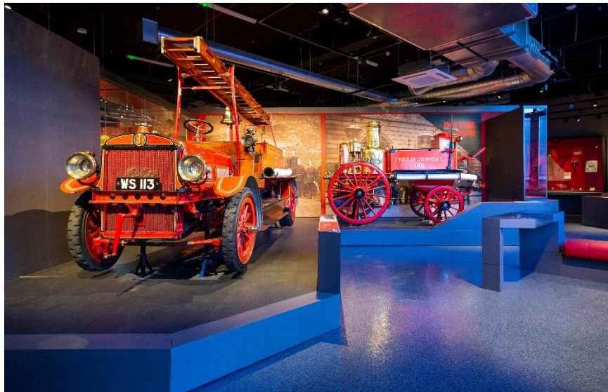
On the Run display with a bench located in the space